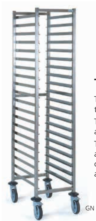
GN 1/1 - 20 levels

The slide bars are continuous welded on an automatic welding bench. The weld seam is performed over the whole length of the bar slide without filler metal. This production process ensures even welds. And above all, exceptional resistance to wrenching.