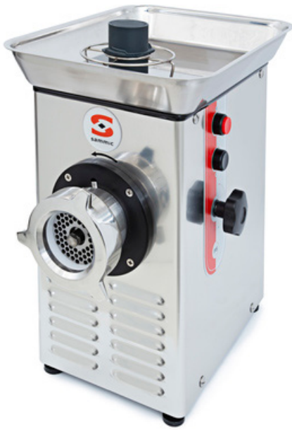
Plate diameter: Ø 82 mm Inlet mouth diameter (1) : 60 mm Plug: -- Electrical connection: -- Total loading: 740 - 1100 W Refrigerated mincer: no External dimensions (WxDxH) ✓ Width: 310 mm ✓ Depth: 440 mm ✓ Height: 480 mm Net weight: 31 kg Noise level (1m.): <70 dB(A) Background noise: 32 dB(A) IP Protection grade: 21