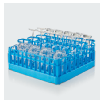
GV 50/25 glass rack with 5 removable stacking rows (to tilt glasses)