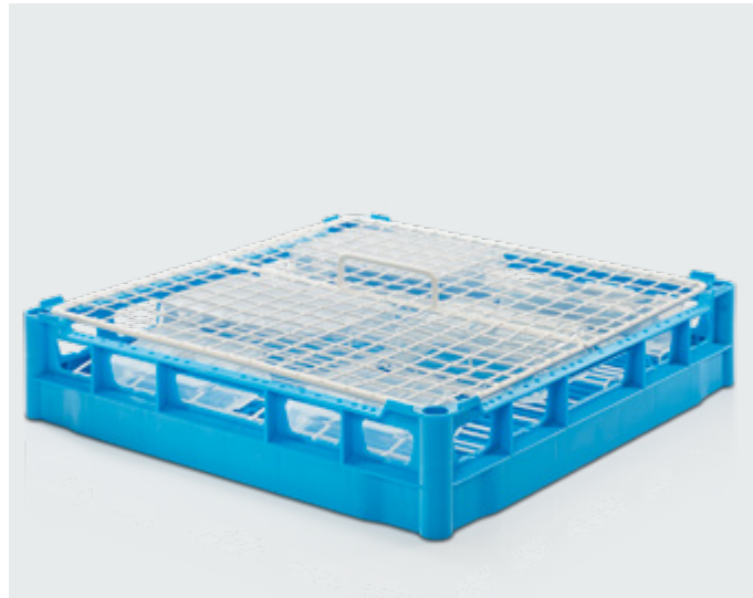
UV 46 x 46/1 cover screen, White, polyamide coated, prevents lightweight items from lifting out of VKV 50/2 or VKV 50/2 BK small parts rack