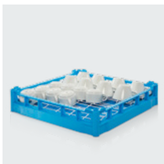
TAV rack insert for cups, white, polyamide coated, with sloping rows for VKV 50/2 small parts rack