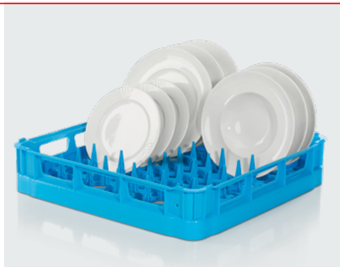
VKV 50/1 plate rack for plates, dishes, cups, saucers

White, polyamide-coated stainless steel racks are also available in the standard 500 mm size for diverse washware. Many of the racks shown here are also suitable for use in rack type or flight type dishwashing machines.