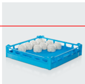
VKV 50/2 small parts rack used as base rack for BKO cutlery basket VKV 50/2 BK (close mesh) small parts rack for small cutlery