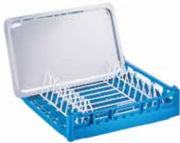
Tray insert (NKT) rilsan-coated wire, for 9 large trays, cut out on one side for base rack NK+ (distance between rows: 39 mm)