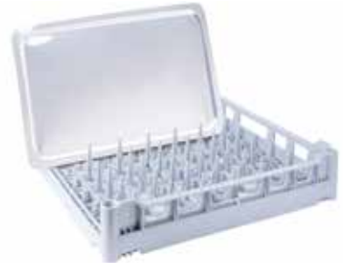
Tray basket (T-06-09) for 8 trays