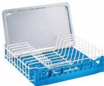
Tray Insert (GN 1/1) Rilsan-coated wire, for 9 large trays, cut out on two sides to fit into base rack NK+ (distance between rows: 37 mm)