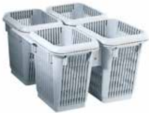
Cutlery carrier (CBS 4) with pyramid-shaped base