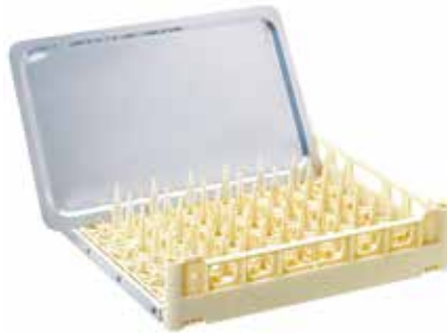
Tray insert (UKT) plate rack for 8 large trays, reinforced with stainless steel rails